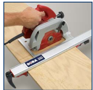
Circular Saw Guide