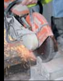
REINFORCED CONCRETE CURBING