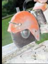
REINFORCED PRE CAST CONCRETE