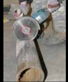
REINFORCED WALL STEEL PIPE