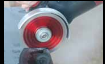
GRANITE and STONE